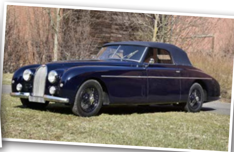
BUGATTI 101 Cabriolet - Gangloff (1951)