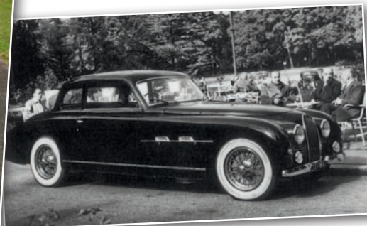
BUGATTI 101 Coach - Gangloff (1951)