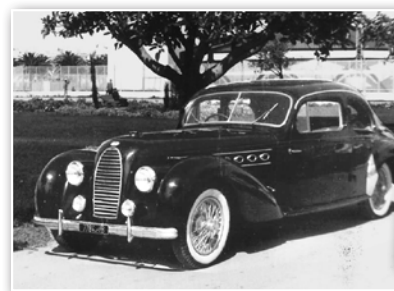
BUGATTI 101 Coach - Guilloré (1951)