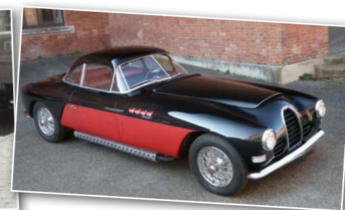
BUGATTI 101 Coupé - Antem (1952)