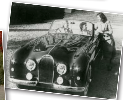
BUGATTI 101 Cabriolet - Gangloff (1952)