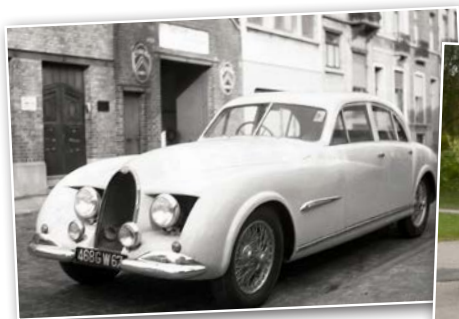
BUGATTI 101 Berline - prototype (1950)