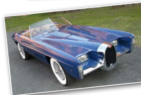
BUGATTI 101 Roadster - Exner / Ghia (1965)